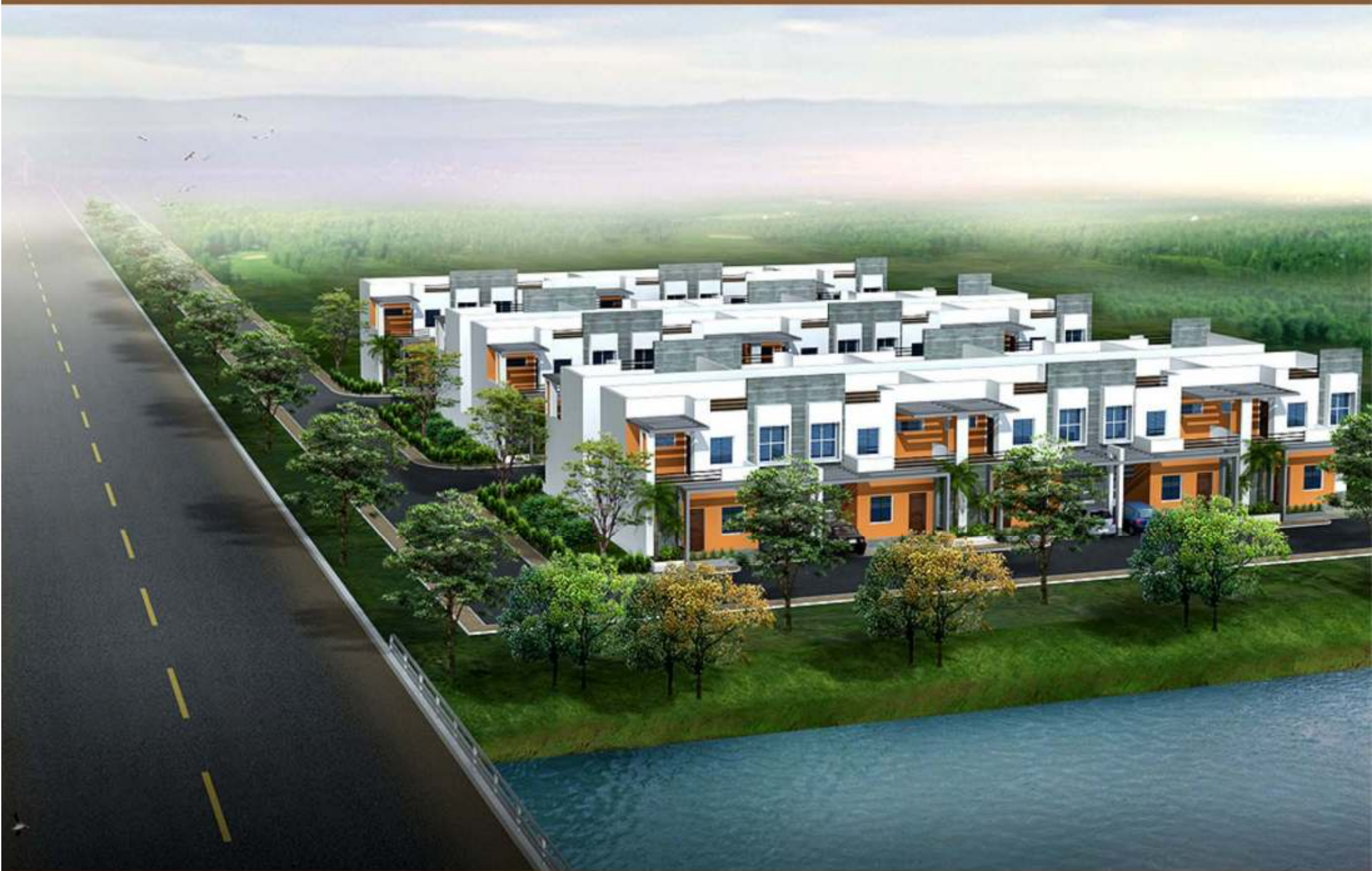
VIEW FROM VAIGAI BRIDGE